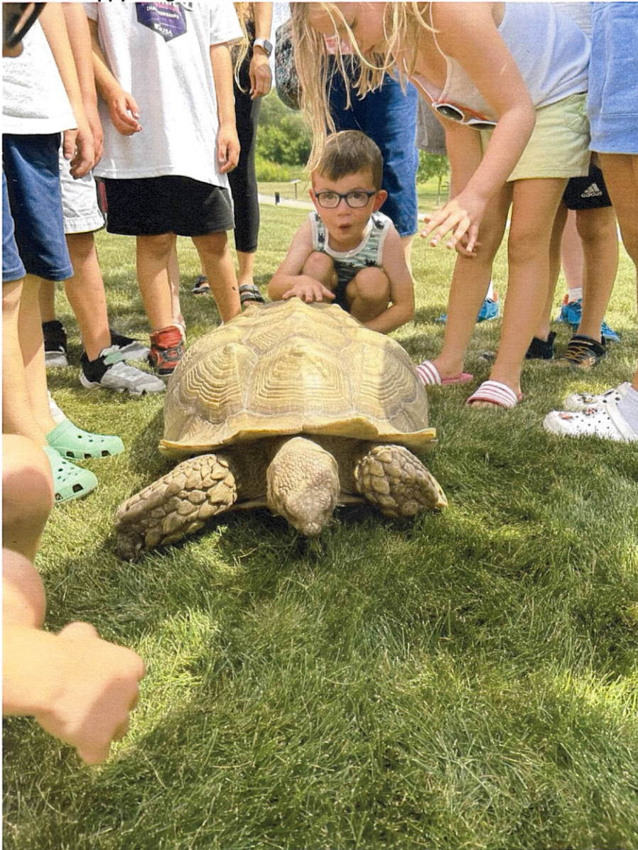
Random happy image of the month: