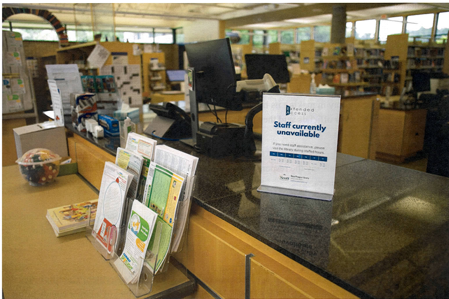
This past June, Scott County Libraries launched extended access at the New Prague Memorial Library.